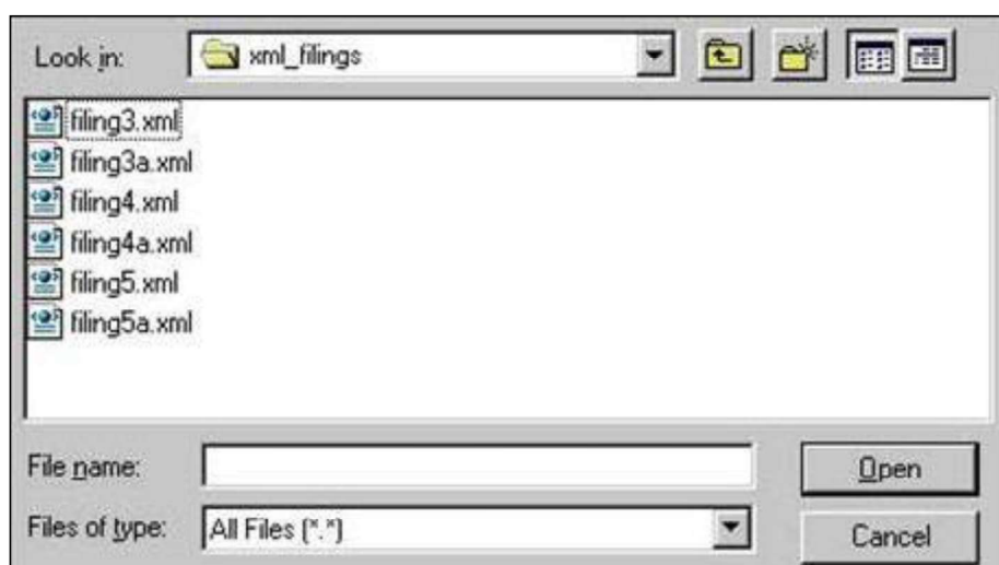
Figure 9-5: Transmit Live Submission File Upload Window

Note: If your XML submission does not appear immediately, change the Files of Type to All Files (*.*) .